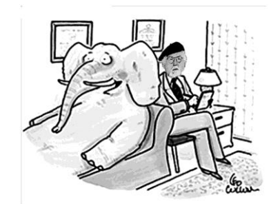
Whose body? Whose distress?